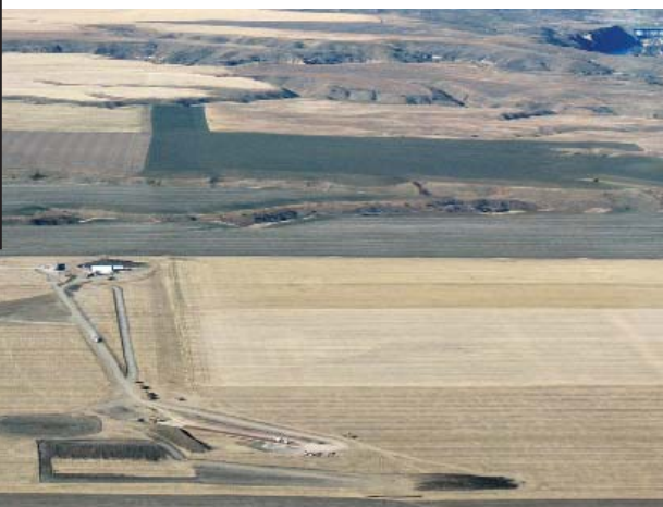
An aerial view of the Highwood Generating Station project near Great Falls shows the excavated area for the cooling tower.