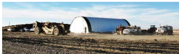
Wickens Construction of Lewistown started site preparation in October.