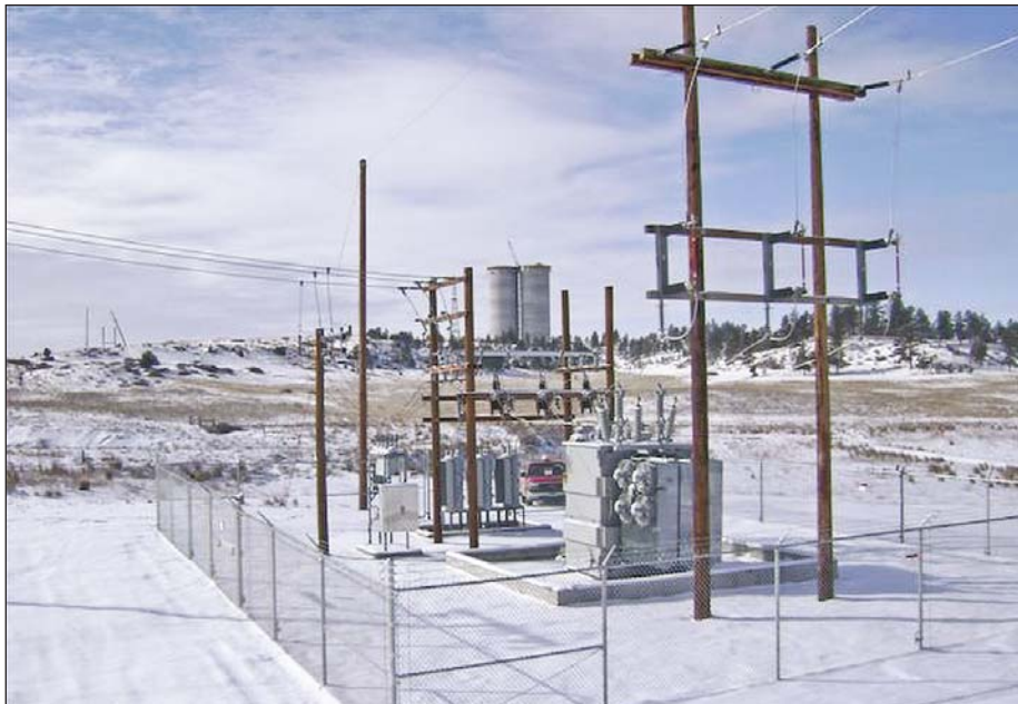
To accommodate additional capacity for the Signal Peak Energy coal mine, Fergus crews spent one month building this substation. The two silos (center back) will hold coal waiting to be loaded on 150-car unit trains.

Fergus Electric crews worked for one month building a 5 MVA substation near the mine site. After selecting the location and pouring a concrete pad, two three-man crews framed and set 12 poles, installed a 50,400 lb.