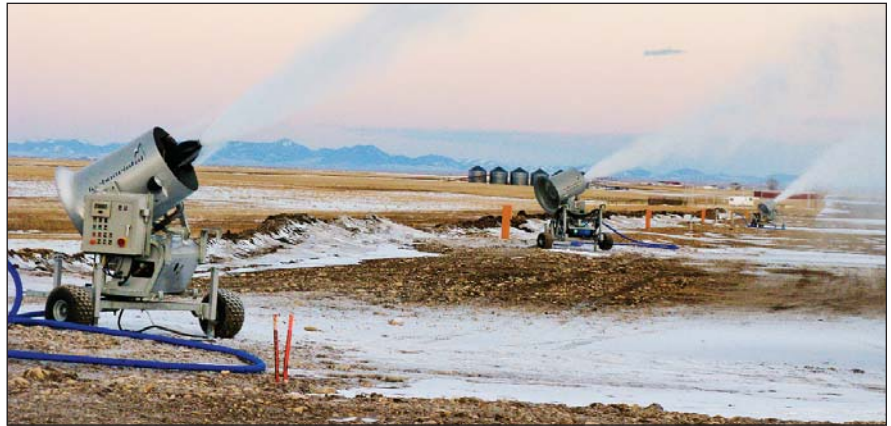
Water is sprayed over a controlled area and the air temperature, between 15 and 25 degrees above zero, causes the mist to freeze as it falls to the ground.

WTI chose the Lewistown site for several reasons. The terrain is flat and even, and it offers a good variety of weather conditions for a variety of experiments. Its location is fairly close to Bozeman, and they have developed a good relationship with the airport facility. In just the few years since it was established, Transcend has become WTI's primary test site in the Northwest. Cuelho says the site can accommodate several different types of experimentation simultaneously and has tremendous potential in the future. Not only does it allow researchers to conduct a variety of tests, it also prof-