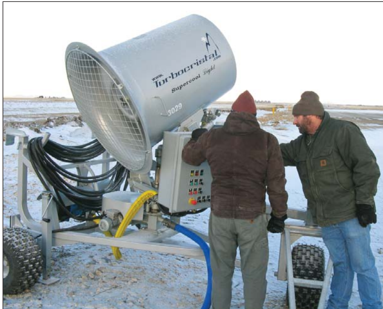
Western Transportation Institute scientists conduct research revolving around transportation issues. Here, they are programming a giant sprinkler used to make snow to test de-icers and anti-icers.

2,000 square foot shop and a 1.3 million gallon reservoir at the test site. Additionally, they have added two smaller buildings for snow-making equipment and storage.