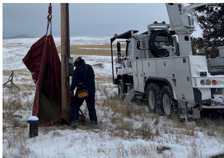
Fergus Electric Apprentice Lineman Collin Sullivan slowly lifts the tarp allowing the dirt to gradually fill the hole around the meter pole, tamping the dirt manually.

Our crews just finished several large cable replacement projects throughout our service territory. The Roundup crew is currently busy replacing 80-plus poles in the Musselshell area. We will begin the new year by testing the structural integrity of our wood poles, and plan to test more than 6,000 poles across the next 12 months. In