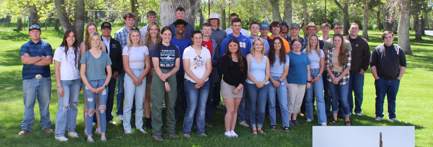
Luck of the Draw winners at last year's Annual Meeting.