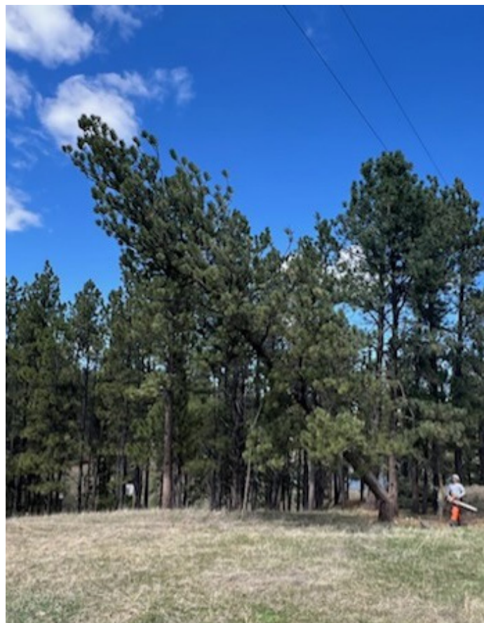
Jacob deRosier fells a tree south of Grass Range within Fergus Electric's right of way. The co-op's goal is to protect cooperative powerlines and members' property from wildfire.

Mother nature will always have the upper hand, but