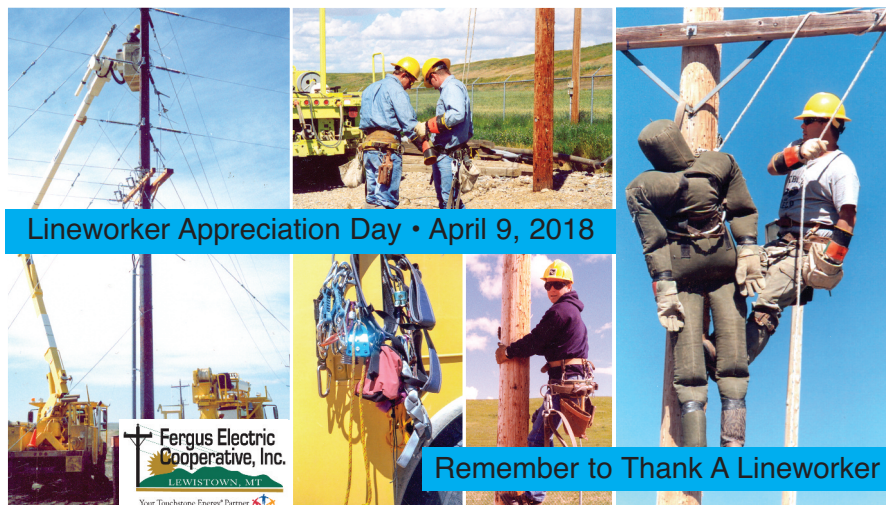
Lineworker Appreciation Day • April 9, 2018