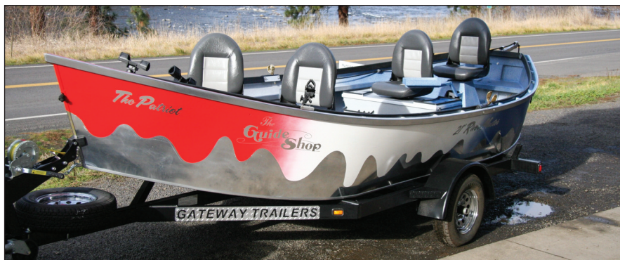
From left: Brett Nienhuis welds aluminum. All “Big Fish” drift boats are 100-percent welded; Nienhuis demonstrates his handicap-accessible boat; “The Patriot” is his favorite custom drift boat.

Nienhuis makes boats this way to make life easier for the fisherman, and he’s happy to cater to any special needs, especially when it comes to interior options, which include rod holders, coolers, heaters, side trays, rod lockers, cup holders, tackle storage, seating capacity, moveable seats and more.