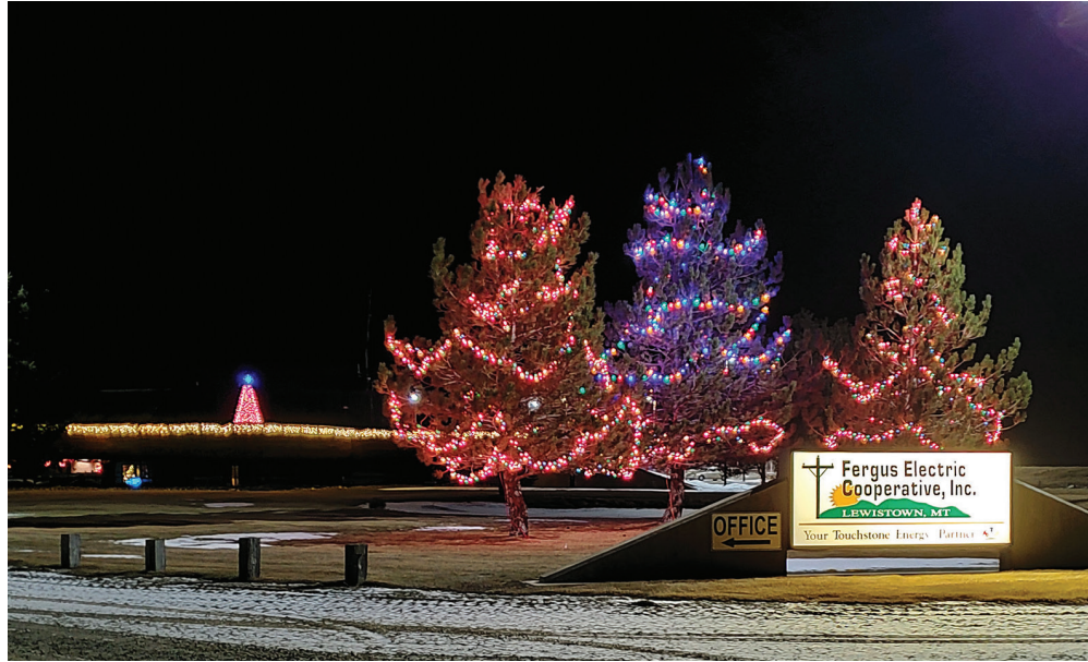
Fergus Electric Cooperative is looking festive after employees decorated both the outside and inside of the headquarters building. Dale Rikala built a Christmas tree and it was installed on the roof of the office.

As we replace the system, there may be times when we need to change out an existing meter prior to the new communication being installed. If that occurs, we will ask