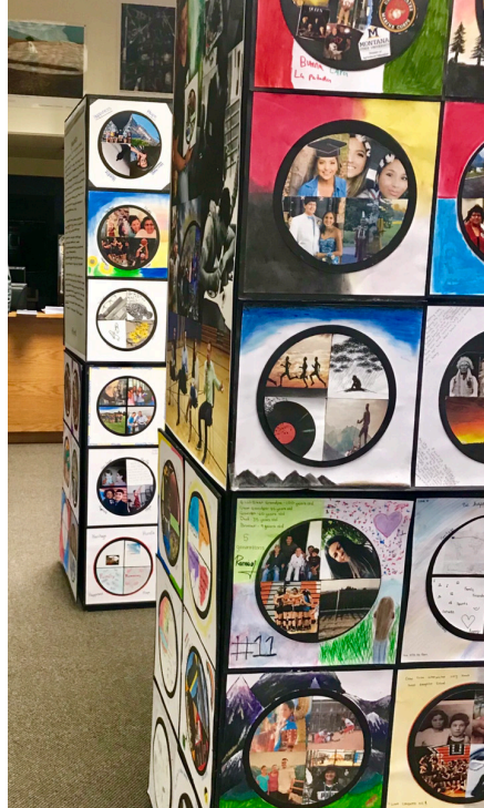
Students' exhibit displayed at 2019 Unreserved assembly.

"The kids appreciated his example of being able to speak about difficult